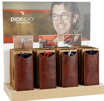
EXTRA THIN 24 units