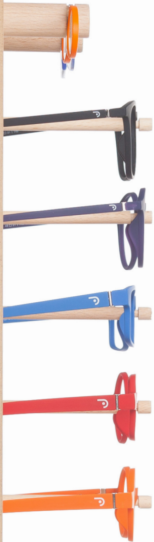
A Exhibitor 16 units. without WAREHOUSE