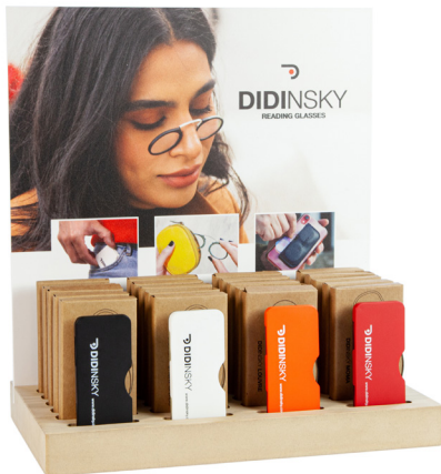
ARMLESS 24 units