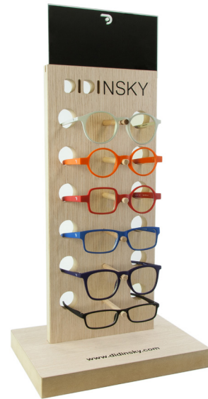
READING 6 units