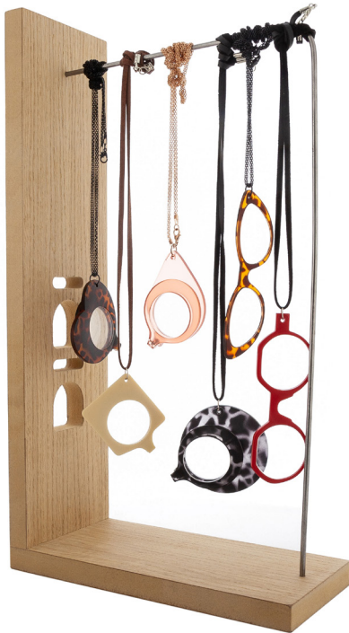
MUSA/MOCO 6 units