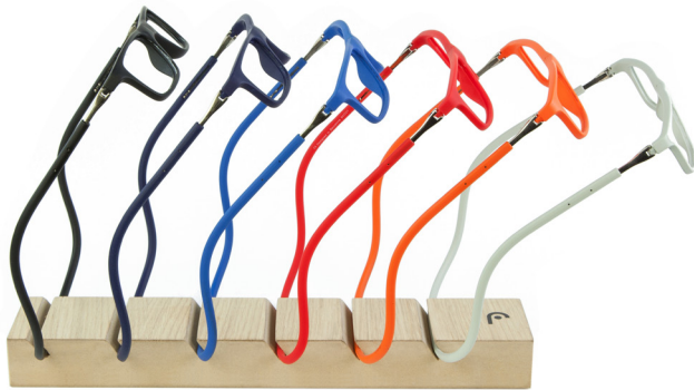
MAGNETIC 6 units